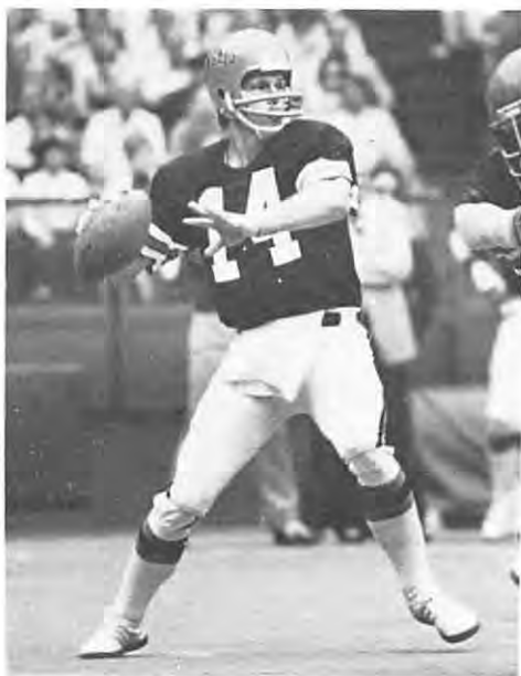
Bengals' Quarterback Ken Anderson.