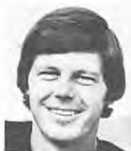
KEN ANDERSON QB 30 6-3 208 Augustana (Ill.) 9