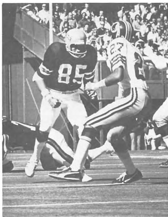
WIDE RECEIVER ISAAC CURTIS ... 47 pass receptions in 1978